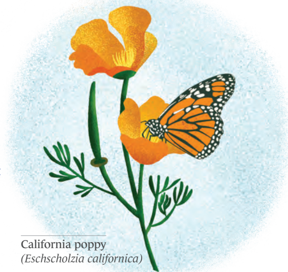
California poppy ( Eschscholzia californica )